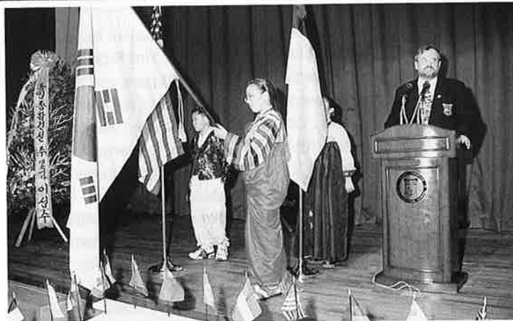
FLAG CEREMONY AT THE NEW BUILDING DEDICATION