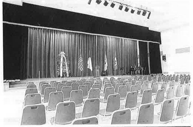
NEW 250+ SEAT AUDITORIUM