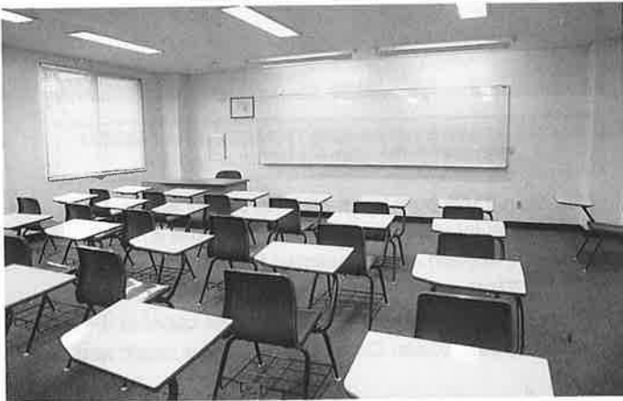
NEW MIDDLE SCHOOL CLASSROOMS