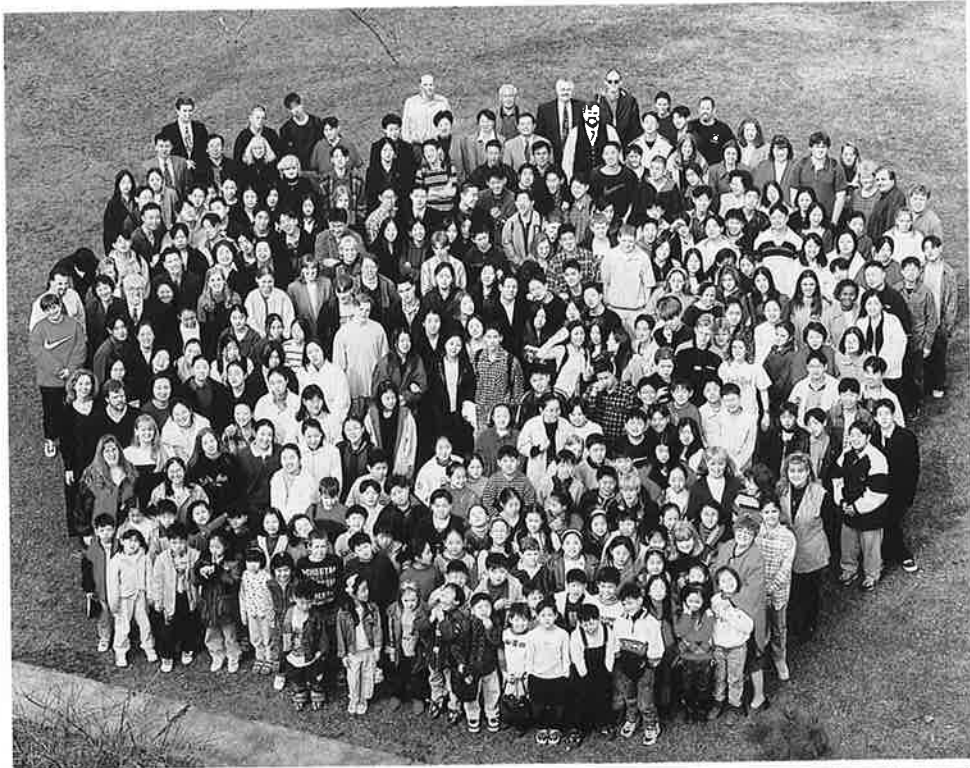
1997-1998 TCIS STUDENT BODY, FACULTY, & STAFF