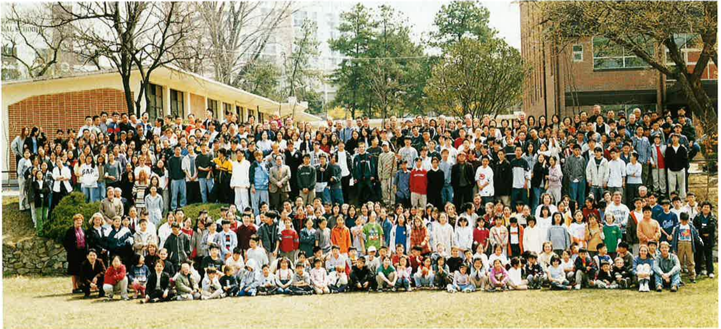
TCIS 2000-2001 Student Body, Faculty, and Staff