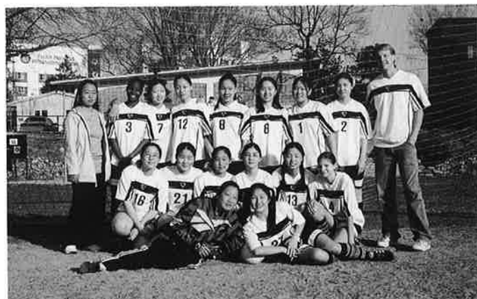
2001 KAIAC Girls' Soccer Division II Conference Champions—TCIS

#4 - The TCIS Girls' Soccer team winning the Division II conference championship.