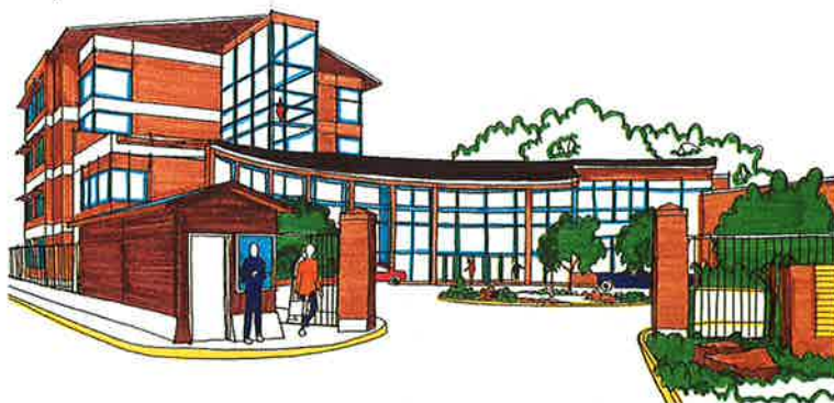
Architectural drawing of the new entrance near the present dormitory gate and the high school and admin/student services buildings and atrium