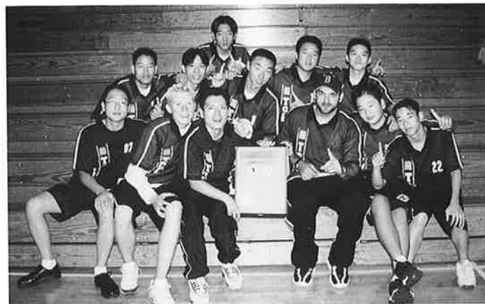
2000 KAIAC Boys' Volleyball Tournament Champions—TCIS

#1 - Beating Seoul American two straight matches on their home court to capture TCIS' first KAIAC boys' volleyball tournament.