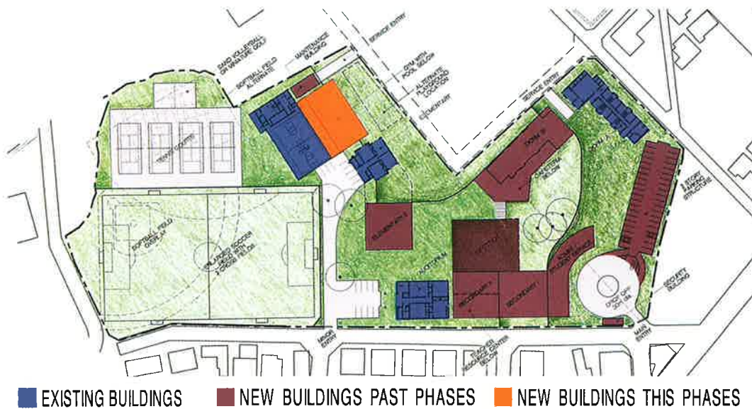
TCIS Master Plan for a projected 800 students