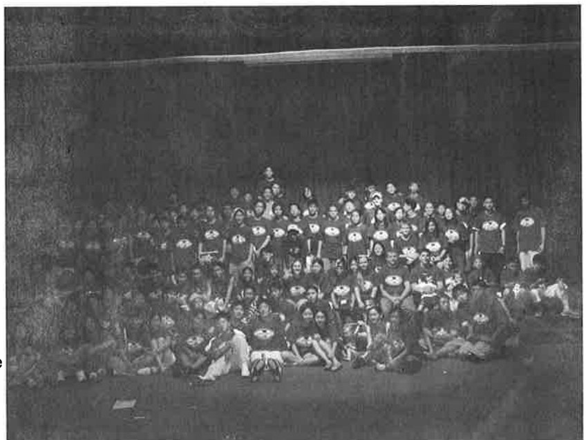
The over 150 boarding students and staff who attended Breakaway II

Over the years, parents of dormitory students relate that registration day is a difficult day and it is never easy for the new dorm student to leave family for an extended period of time. The TCIS boarding staff have recognize this struggle for new students to adjust. They too have come to Korea and have left behind family, friends, culture, and have had to adjust to their new surroundings. Our boarding staff recognized the importance of making friends, getting acquainted with a new environment, and providing a time of bonding between the students, peers, and staff. Thus came the concept of what we now call "Breakaway," a mini-camp set aside at the beginning of each school year to assist students and staff in the process of adjusting. "Breakaway" provides a laid back approach full of activities to help kids bond, learn about the school, dorm program and rules, and get kids comfortable in their new home.