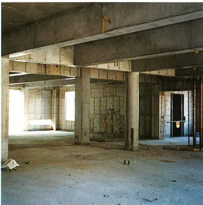
View of the new High School 2nd Floor Classrooms minus their walls

Financing for the building includes funds from capital development fees and tuition fees and loans from individual parents. The cost of the Phase I buildings is over 3,600,000,000 KRW. The school expects to acquire a debt from the construction of the buildings of between 500,000,000 – 1,500,000,000 KRW. The school Master Plan Committee has recommended to the headmaster that he create plans in the spring to provide a fundraising opportunity for all parents to contribute toward the furnishing of the new building.