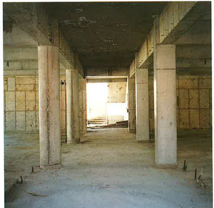
View of the future hallway on the Second Floor of the new High School

The new high school building will include five floors with twenty (20) classrooms, inclusive of four (4) very large science lab/classroom areas, large spacious hallways, and an elevator. Both buildings will have central heat and air-conditioning and were purpose built to be very energy efficient.