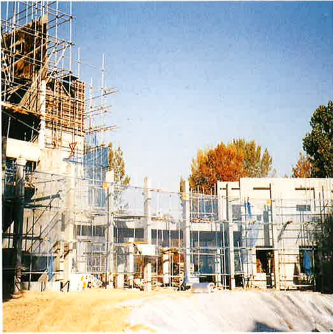
Construction continues on the Front Exterior of the New Building

The school's Master Plan Committee is working with faculty members and the school administration to develop plans for the use of the space vacated in currently existing facilities by the completion of the new building. Space will be vacated in the current high school building and the ground floor of the elementary building. This will give more space for secondary school classes and elementary educational needs.