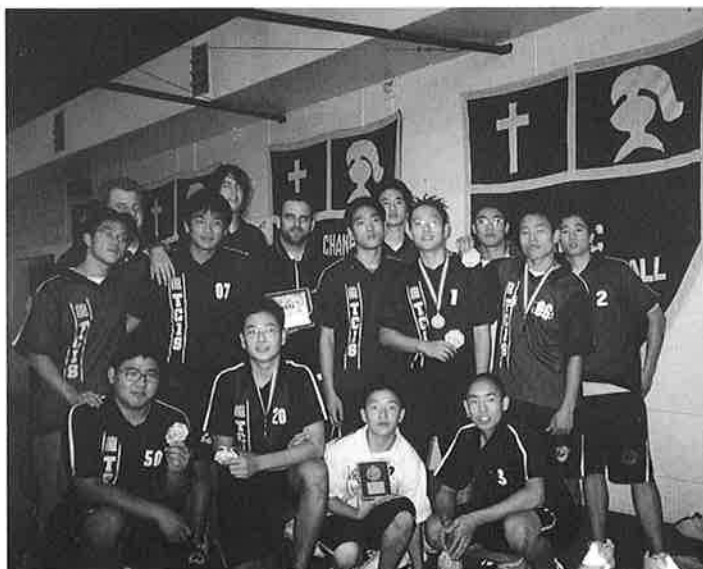
TCIS 2002 Boys' Volleyball Team received numerous honors and awards at the KAIAC Tournament